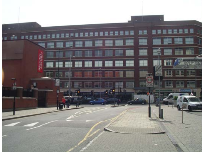
Figure 20 - Some positive urban features such as well-kept frontage and promenades (Azmin-Fouladi 2007)