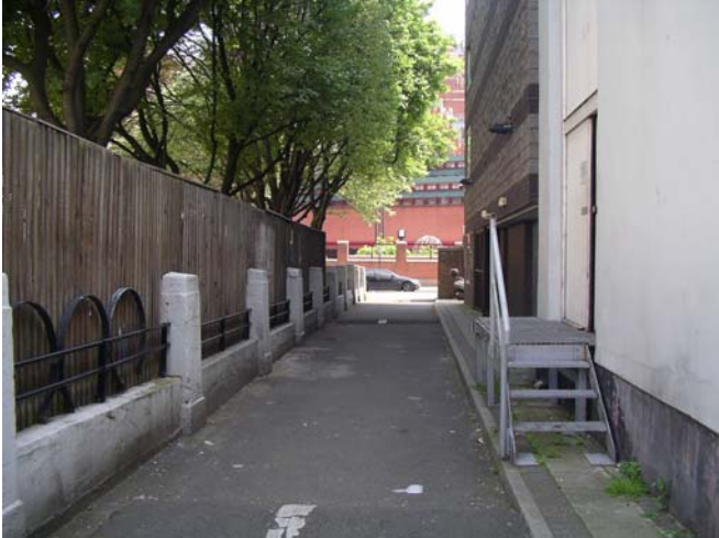
Figure 1 - A road with a high, long boundary one side and a building with very few windows looking down onto it. (Azmin-Fouladi 2007)

frontage, contributing to a positive feeling about the space. (All photos are taken in our current test area of Somerstown, London).