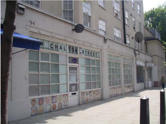
Figure 2 - A shop front with covered windows. Poor natural surveillance of the surrounding area is hypothesized as a contributing negative factor to people’s perceptions of their environment (Azmin-Fouladi 2007)